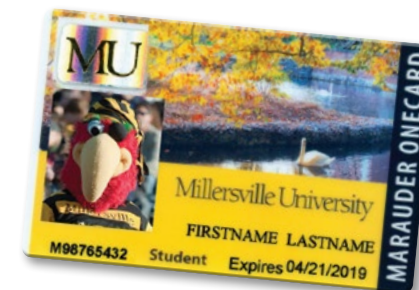
Photo IDs are optional for online students. If you would like one, you may submit a photo at www.mville.us/photoid or visit the University Services Office in Boyer Building, Room 123, Monday-Friday, 8 a.m. – 4 p.m.

ID cards can be picked up during normal business hours (please note that at this time, IDs may only be picked up in person). For more information, visit the University Services webpage at www.millersville.edu/univsvcs .